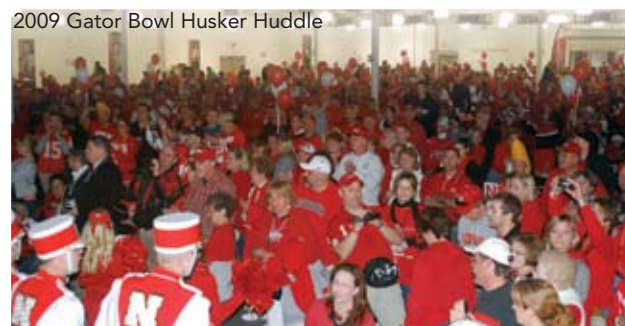
2009 Gator Bowl Husker Huddle

The Wick Alumni Center's Holling Garden is the place to be on Friday afternoons before home football games. The Nebraska Alumni Association will host a series of FAC events where you can enjoy the company of former Husker letterwinners, students,