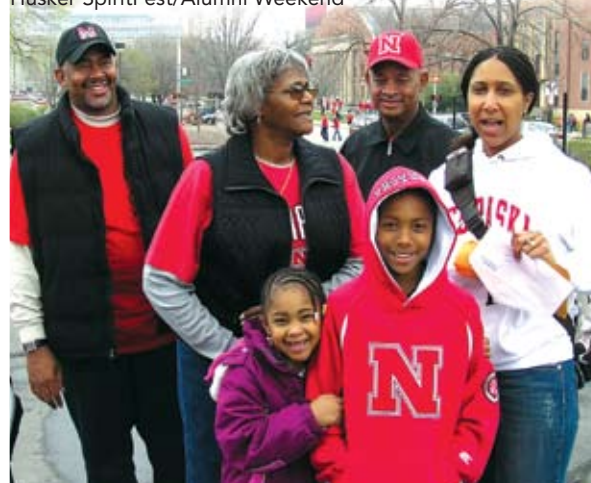
Husker SpiritFest/Alumni Weekend

alumni and fans. A Husker expert will be on hand to break down the game, and local sportswriters will give their views of the team each week. There will be a cash bar, food for purchase and loads of Husker spirit, so be sure to drop by from 4:30 to 7 p.m. on home game Fridays. Check www.huskeralum.org as the season nears for additional details.